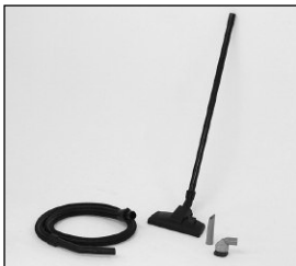
Hose and tools included