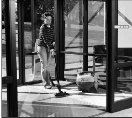
QuickStar™ B goes anywhere