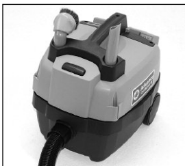
Convenient tool caddy and handle