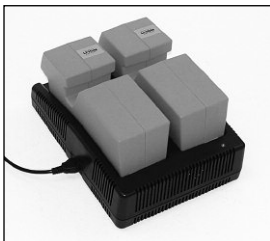
Two batteries and charger included