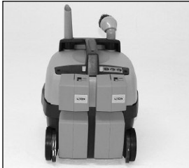
Two lithium batteries provide 1 hour of run time