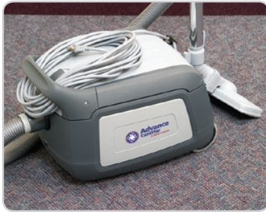
The coiled up cord is conveniently stored on top of the machine under the handle.