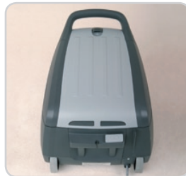
Low profile wedge shaped design maneuvers easily around obstacles.

Unique side panel design gently diffuses pure exhaust air on sides and top