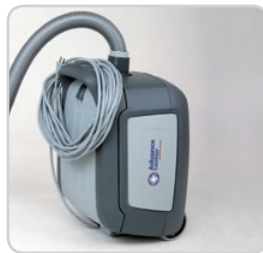
Stands on end for cleaning stairs and compact storage.