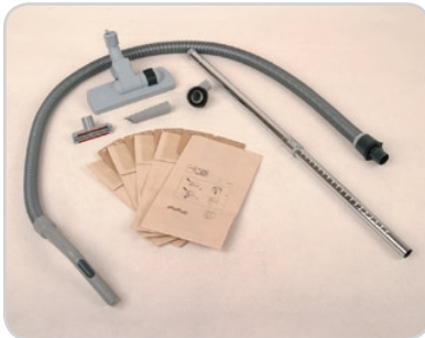
Telescopic wand and accessories make cleaning a multitude of surfaces quick and easy.