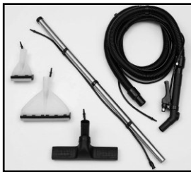
Off aisle wand kit is an optional accessory