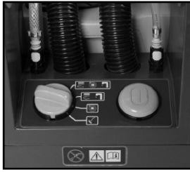
Easy to use scrub selection dial (left) and on/off switch (right)