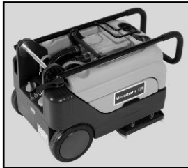
Handle bar folds over top of base for compact storage or easy carrying and transport