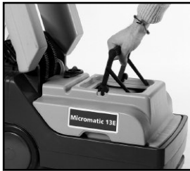
Recovery tank can be easily removed and emptied