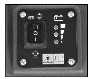
Two position, single button operation.