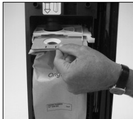
Quick change bag is the first level of filtration