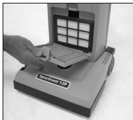
Certified H.E.P.A. is the final filtration stage