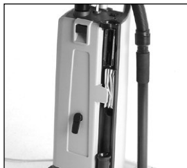
Accessories are conveniently tucked behind the vacuum wand