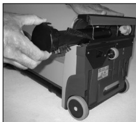
Tools-free access to remove brush