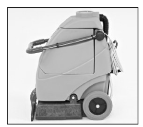
Handle folds for easy storage and transport