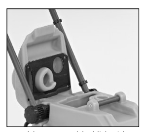
Durable, rotomolded lid with flip up design