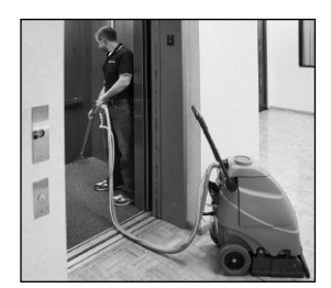
The AquaClean® 12ST self contained extractor is the perfect choice for small area carpet needs