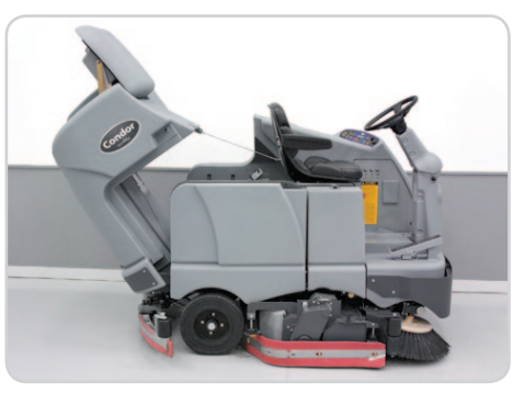
No tools are needed to lift off recovery tank for extra access to batteries and squeegee assembly.