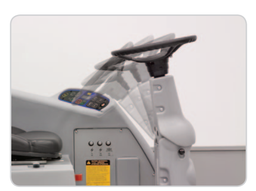
Ergonomic command compartment with tilt steering allows for easy boarding.