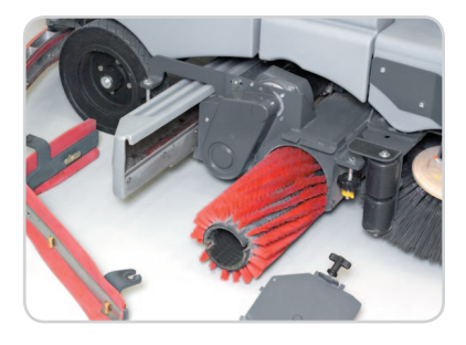
A large, non-corrosive hopper on cylindrical models allows for maximum debris capacity without overflow and slides out for easy debris disposal.