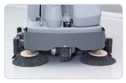
Retractable side brooms on cylindrical models sweep debris away from pallets and walls.