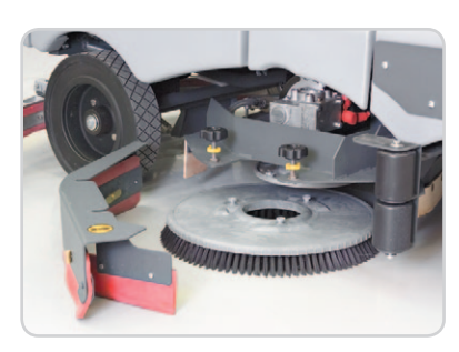
A large range of interchangeable disc and cylindrical scrub deck options provide the right tools for the specific job.

The Condor with EcoFlex System delivers the flexibility to clean your floors more efficiently. By using a system that cleans like you do, you'll reduce your cost to clean and create a more sustainable cleaning program.