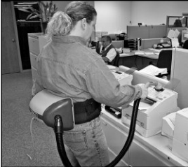
Detail cleaning on the go is easy with handy crevice tool and bristle brush