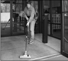
Combination floor tool is easy to use on hard or soft floors