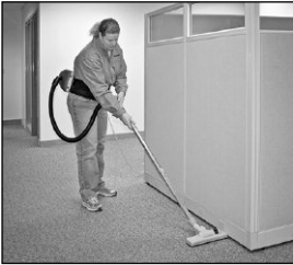
Edge cleaning is done easily with the Adgility™