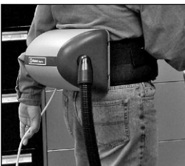
Padded belt is adjustable for operators comfort