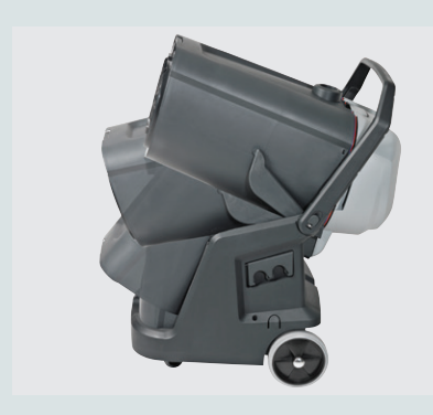
The VL500-75 and patent pending ERGO "tip n pour" design allows operators to easily empty the tank with 80% reduced effort. Standard "tip n pour" is available on the VL500-55 model.

* Standard on VL500-75; optional on VL500-55; not available on VL500-35.