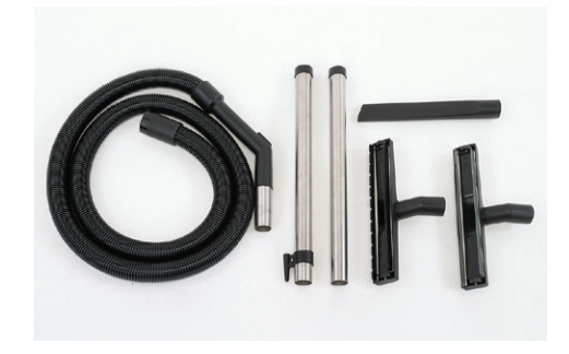
The VL500 series features a variety of standard and optional accessories, including: hose, wand, squeegee floor tool, brush floor tool, crevice tool, dusting tool and front-mounted squeegee.