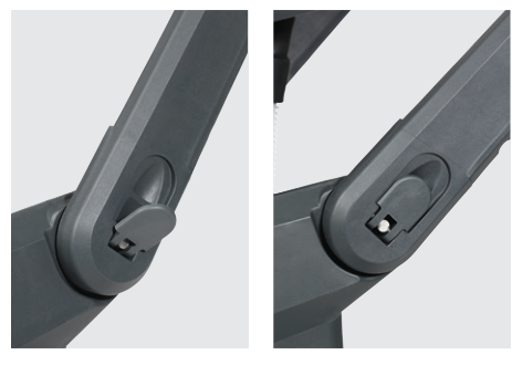
The VL500-75 features an easily adjustable handle to match operator height and maximize comfort.