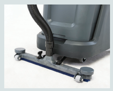
Front-mount squeegee is easy to install, and enables easy cleaning in both forward and backward directions. With a break-away design, the squeegee can be quickly engaged via the foot pedal.

The VL500 wet/dry vacuums offer simple and reliable operation. The 14 and 19 gallon configurations feature a balanced wide stance for superior maneuverability, while the lightweight design of the 9 gallon model ensures easy transportation. For enhanced performance, the VL500 series offers a variety of standard and optional accessories, ranging from hoses and wands to squeegees and dusting tools.